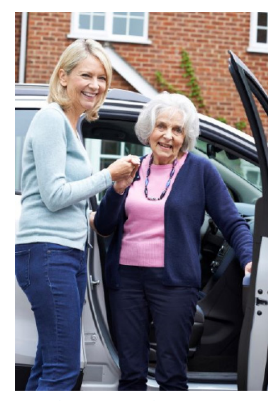
Plan for a ride home from the hospital.

You'll need a caregiver to stay with you for the first week after your Stage 2 surgery. This person can help with meals, laundry, bathing, and cleaning while you heal.